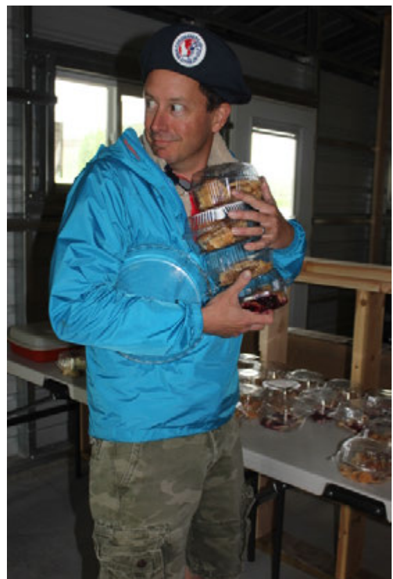
MISSING PIE YOU SAY? YOU MIGHT CONSIDER CHECKING THE FALK'S TRAILER!