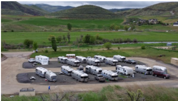
THAT'S RIGHT...15 AIRSTREAMS AT ROYSTONE HOT SPRINGS!

Sunday morning, after a nice little breakfast of muffins, fruit and yogurt, the majority of us packed up and headed home. All-in-all, it was a wonderful first rally of the season. We were thrilled to have such a nice turn-out---thanks to all who attended!