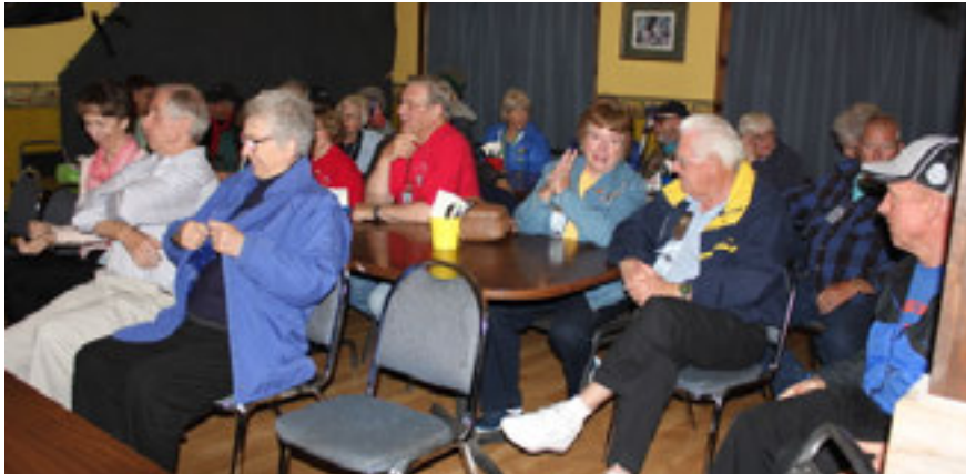
GENERAL BUSINESS MEETING AT THE TRIANGLE RESTAURANT