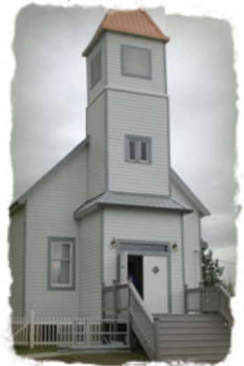
THE OLA CHURCH